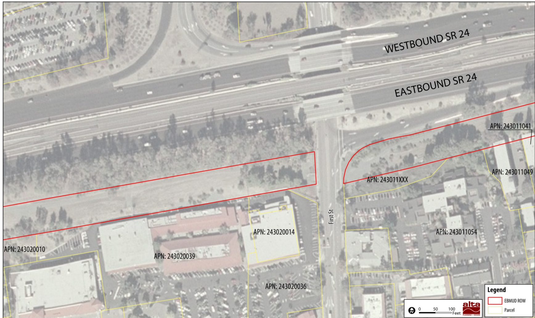
Figure B-4: Study Area 4 Property Ownership (As of April 2010)