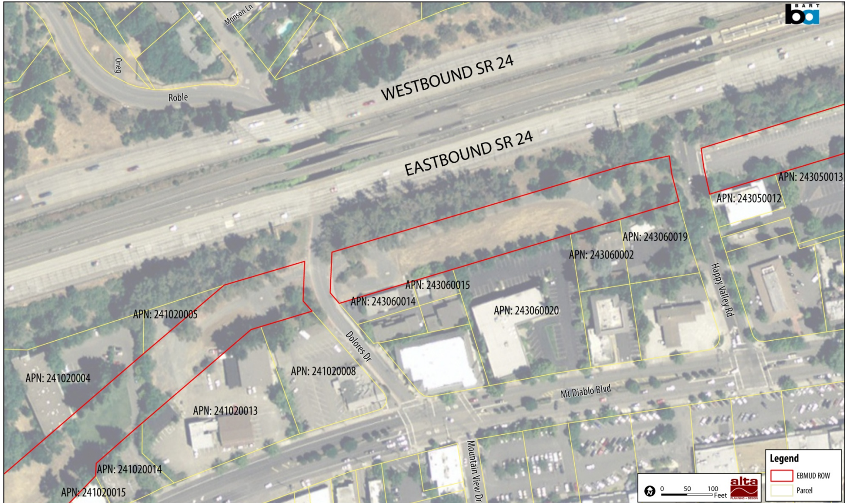
Figure B-2: Study Area 2 Property Ownership (As of April 2010)