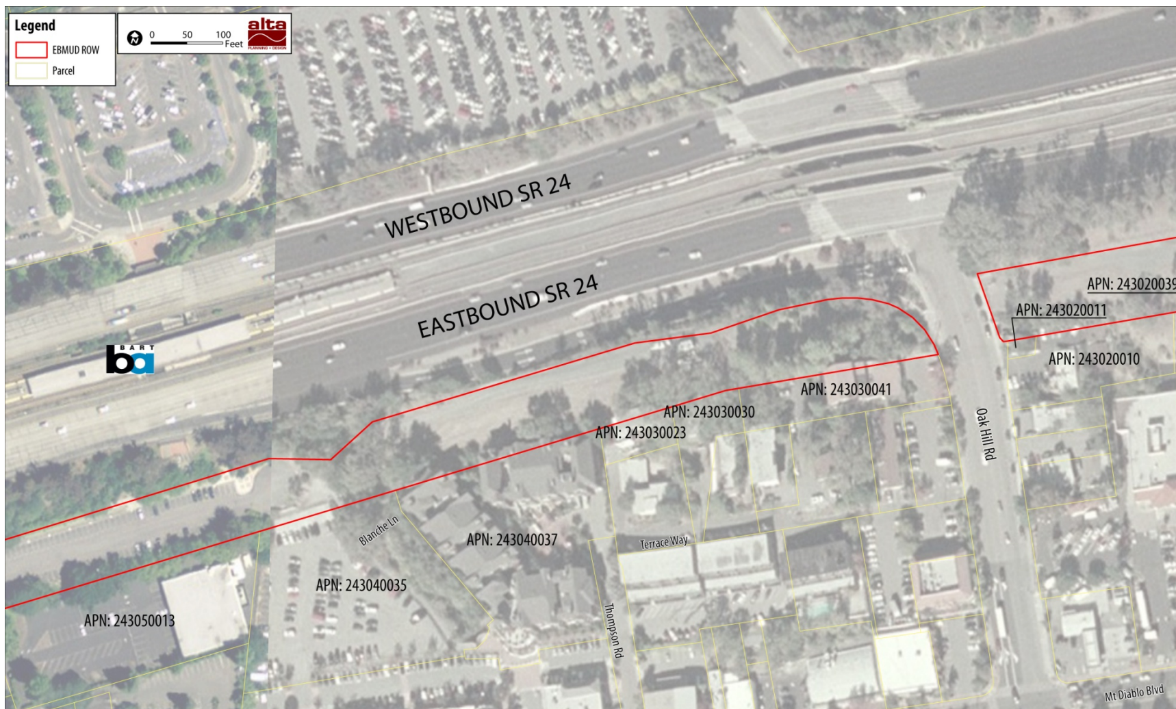
Figure B-3: Study Area 3 Property Ownership (As of April 2010)