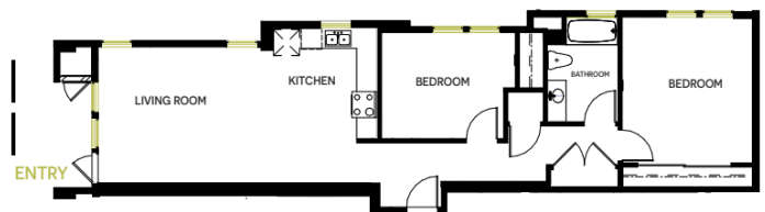
210 LAFAYETTE CIRCLE | UNIT #103