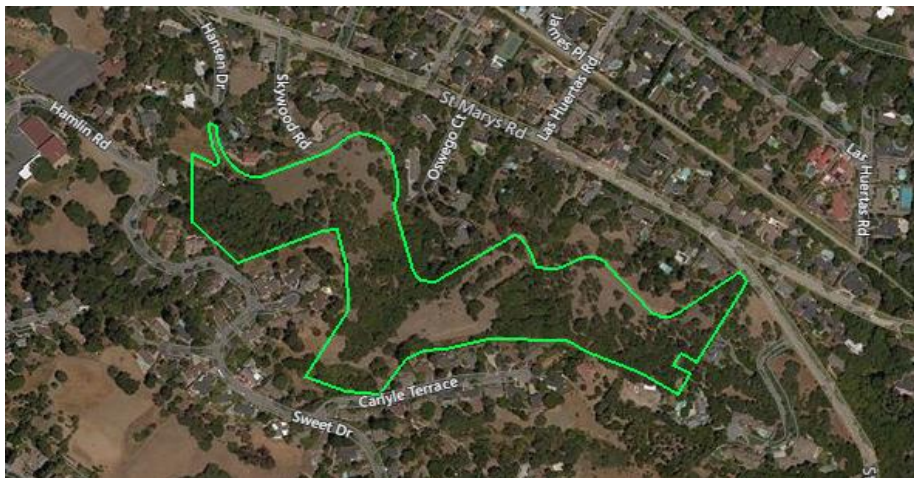
Figure 1 – Property Location Map

The City purchased 20 acres of parkland located between Hamlin Road and St. Mary's Road, initially called the "Batwing" property. Acquiring the vacant property as parkland was of significant interest to the City, as it satisfies needs outlined in several City plans and surveys. The area is now called the Hamlin Nature Park. The City, under the auspices of its Parks, Trails and Recreation (PTR) Commission, has begun the process of developing a Master Plan to develop the site as a nature park with onsite trails and other amenities as decided by the master planning process. This letter provides background on the property and outlines next steps in the master planning process, including upcoming public meeting dates. The PTR Commission encourages all residents to participate in this important process in making the Hamlin Nature Park available for use by the community.