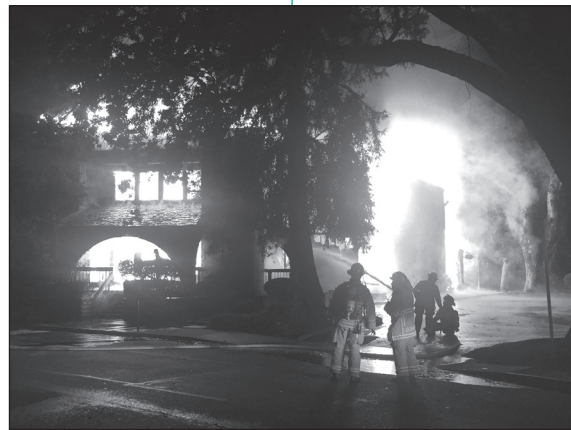
Chamber of Commerce fire, July 13.

You can make your home safer by following the Firesafe Checklist on page 2.