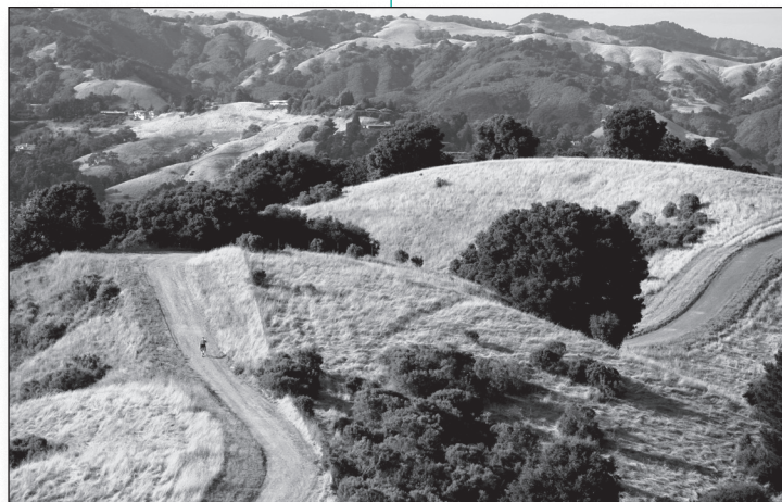
a city extending from park to park

America in the 1950s was a place where the economy was booming, the suburbs were growing, and large numbers of people were exiting the cities in search of their own patch of land. It may have seemed innocent at the time, but the development of all those suburban neighborhoods – defined by a strict separation of land uses and heavy auto dependency – ultimately contributed to and exacerbated the traffic congestion, loss of farmland, and decline in main street retail shopping that now plagues so many of America’s central cities.