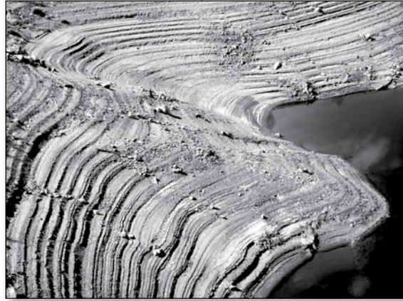
Don Pedro Reservoir, September 2014

◆ Reduced Ballfield Watering. We'll be reducing the watering of our ballfields at the Community Park and Buckeye Fields to two times per week. This may result in some yellowing and browning of the ballfields but this act, by itself, will save more than three million gallons of water this summer. We'll also be checking the water meters every week and hand-watering the most stressed areas of turf to keep it alive until the fall rains arrive.