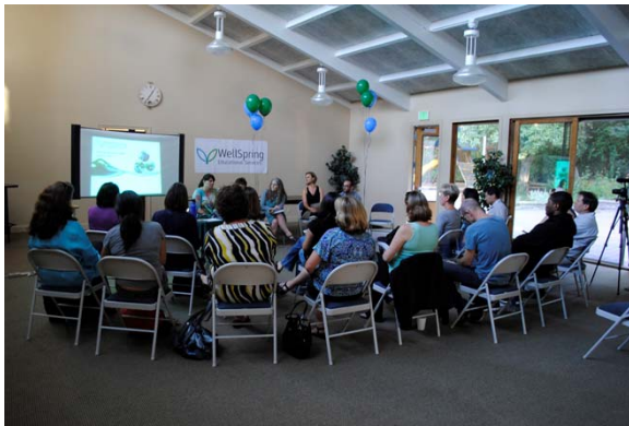
Parent Meeting and Open House at the Lafayette Christian Church July 2013

We believe parents and educators should be partners in nurturing the development and potential of all children, regardless of their disability. We are passionate about helping all students uncover their talents and strengths, and believe that every child can be successful at learning and building healthy relationships.