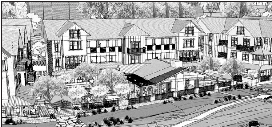
Woodbury Residential Condominiums

If you are interested in learning more about these projects, or tracking them as they progress through the various City boards, you can access meeting