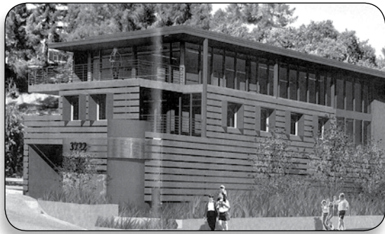
Fresh Connection Headquarters

The Planning Commission has begun consideration of the proposed Terraces of Lafayette project on Deer Hill Road. Once the environmental review is complete, there will be several opportunities for the public to comment on the project before the Planning Commission, Design Review Commission, and Circulation Commission.