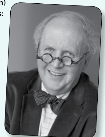
Alexander McCall Smith

Reservations: reserve@lllcf.org or call 283-6513