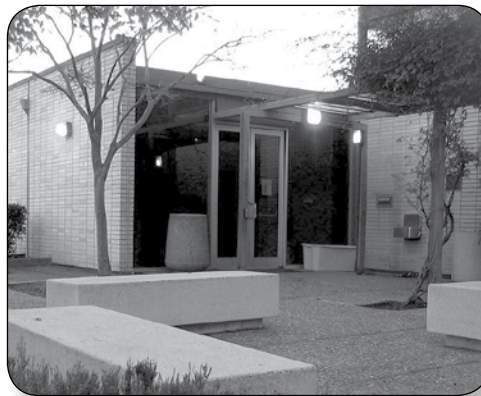
Old Library on Moraga Road