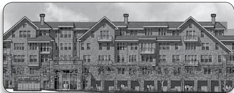
KB Homes Condominiums

like Buckeye Roadhouse . ♦ The City Council recently authorized the installation of new parking meters that take credit cards for downtown Lafayette. ♦ GNC , the health and wellness supplement store, has leased the old Handlebar Toys space near Round Table Pizza . ♦ The former manager of the French Bakery will soon be opening a new eatery in the old Roya's Garlic Garden space. ♦ The big building going up near Bo's Barbeque is all-affordable senior housing by Eden Housing . ♦ The large complex underway across from McDonalds is market rate assisted housing for seniors by Merrill Gardens. ♦ And construction is underway at the old Hungry Hunter site for 23 townhouses.