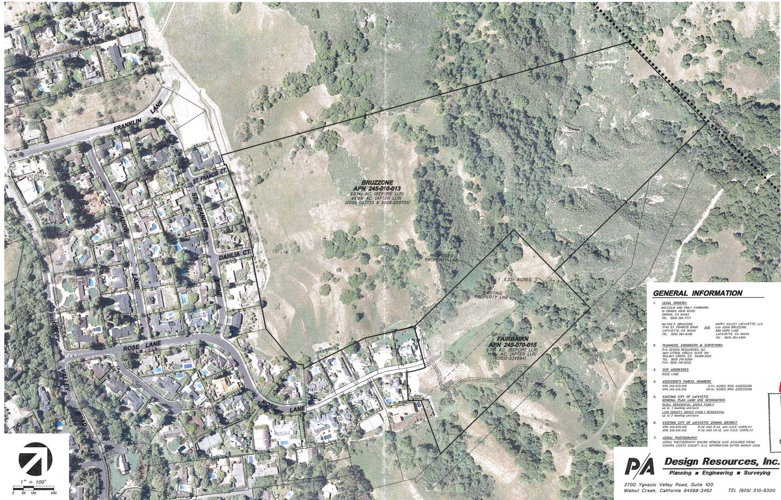
EXHIBIT 1 - AERIAL PHOTO EXHIBIT FEBRUARY 26, 2013