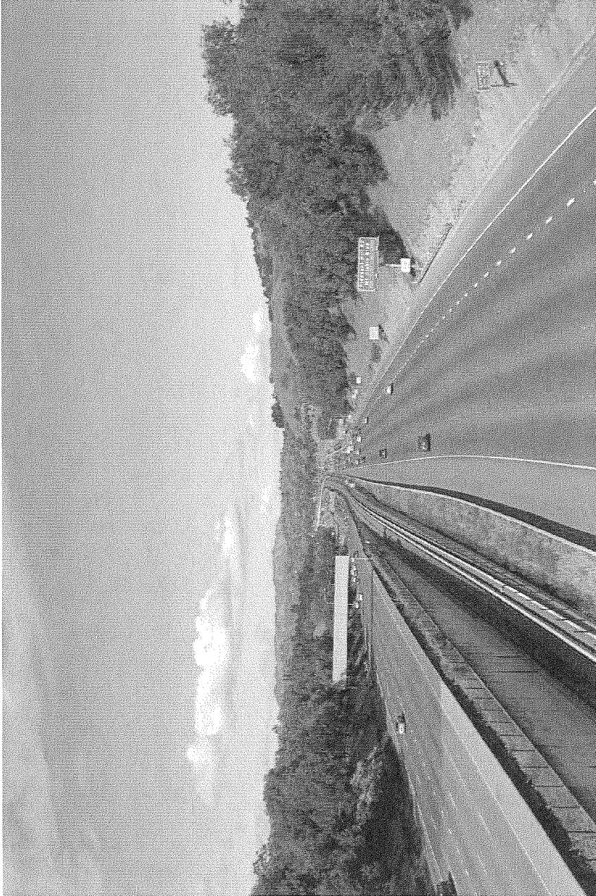
PROPOSED - DAY OF COMPLETION