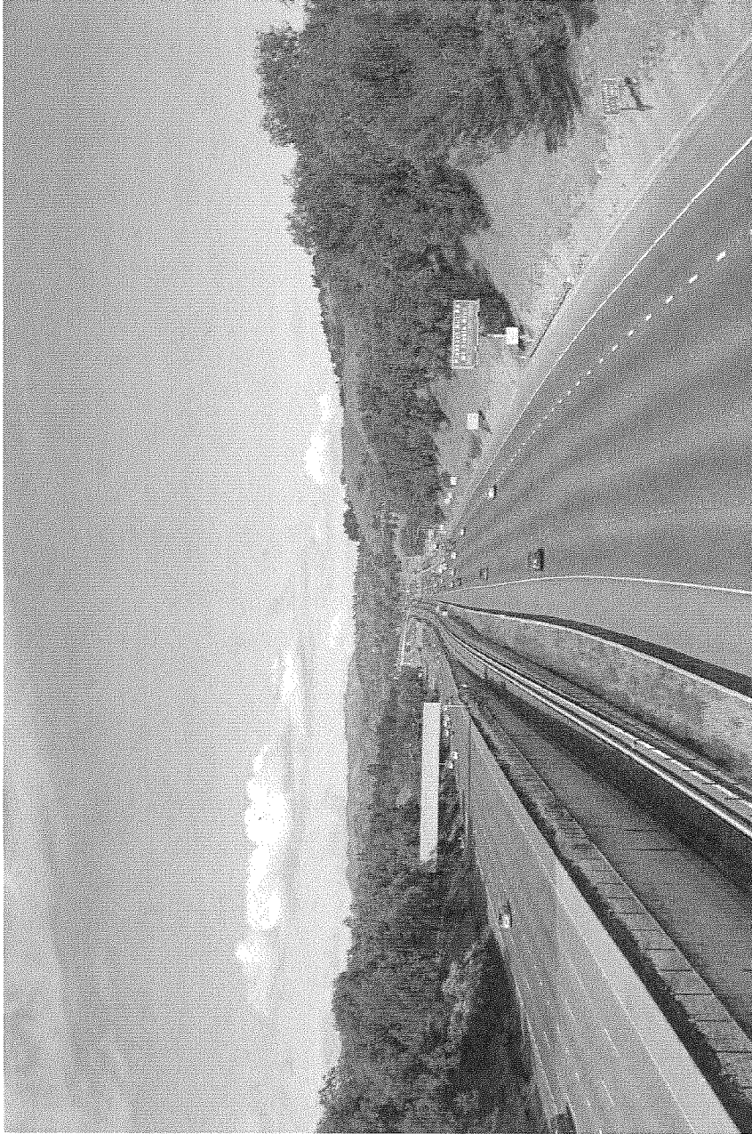
PROPOSED - WITH 5 YEARS LANDSCAPING